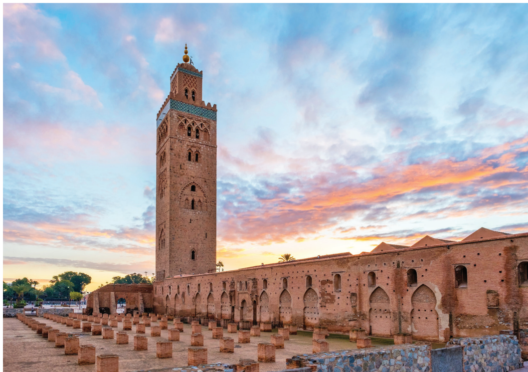
We see the distinctive Koutoubia Mosque – Marrakech’s largest – on Day 11.

Day 6: Fez This morning, we tour the old Mellah (Jewish quarter), with its 17 th -century synagogue. Then it’s off to the traditional quarter to watch artisans craft the acclaimed Fez pottery and ceramics. The afternoon is free for independent exploration. B,D