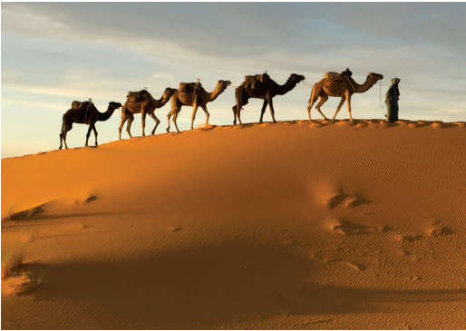
We ride camels in the Sahara on Day 8.

dyers and iron workers, herbalists and wood carvers, painters and lantern makers - all using tools and methods passed down through the generations. We are at leisure this afternoon and enjoy dinner together tonight at a restaurant in Marrakech’s Old Town. B,D