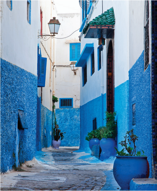
Rabat’s Kasbah des Oudaias

Day 12: Marrakech Today’s first stop: Bab Agnaou, the city’s oldest gate, which dates to the 12 th century. Then we set off to interact with local artisans at a variety of souks in the medina . We visit with yarn