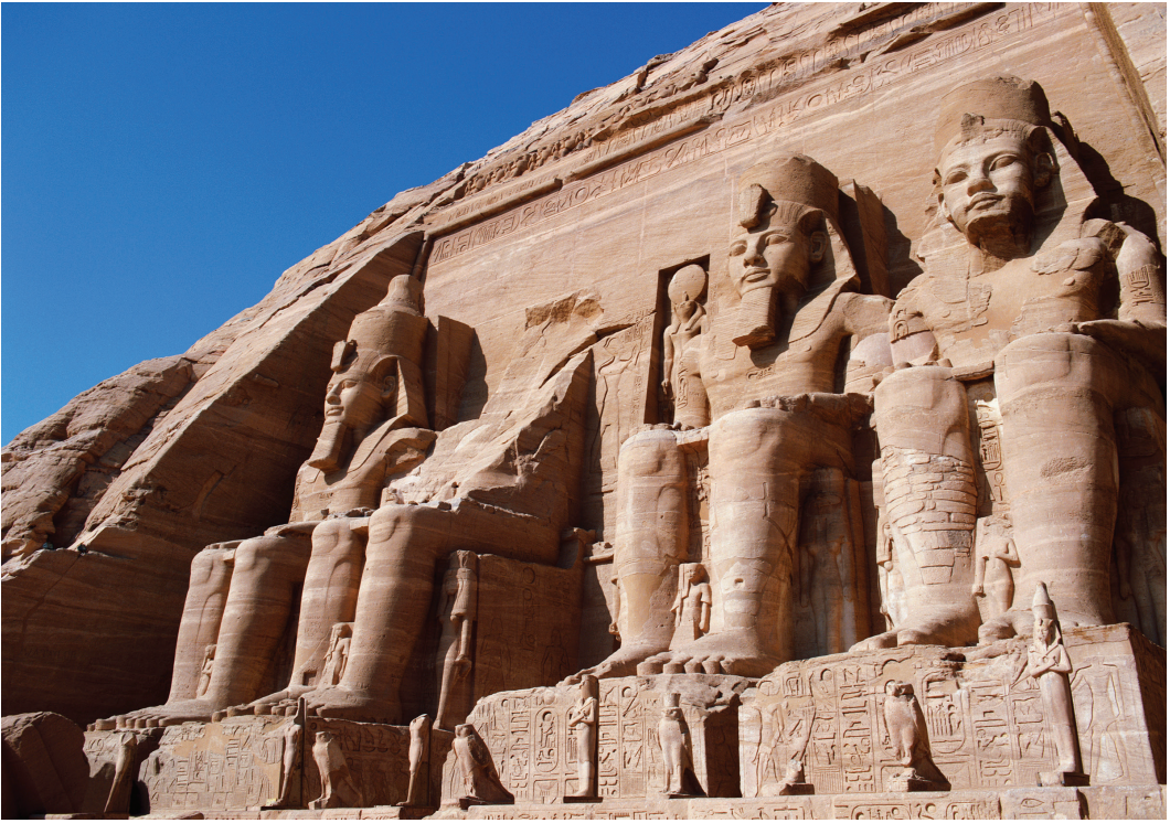
The magnificent temples at Abu Simbel commemorate Ramses II and his queen, Nefertari.

Day 7: Lake Nasser Cruising – Amada/Kasr Ibrim/ Abu Simbel We sail this morning to Kasr Ibrim, the last remaining Nubian settlement in its original location. We learn about this ancient site while overlooking it from the ship’s sun deck. Then we continue on to Abu Simbel’s massive complex of temples guarded by statues of Ramses II and his wife Nefertari, with well-preserved murals inside. B,L,D