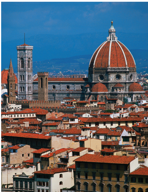
We visit splendid Florence on Day 13.

Day 15: Venice This morning we take a guided walk through St. Mark’s Square and surroundings. Our afternoon is free to explore Venice independently; tonight we bid “ arrivederci ” to Italy and our fellow travelers at a farewell dinner. B,D