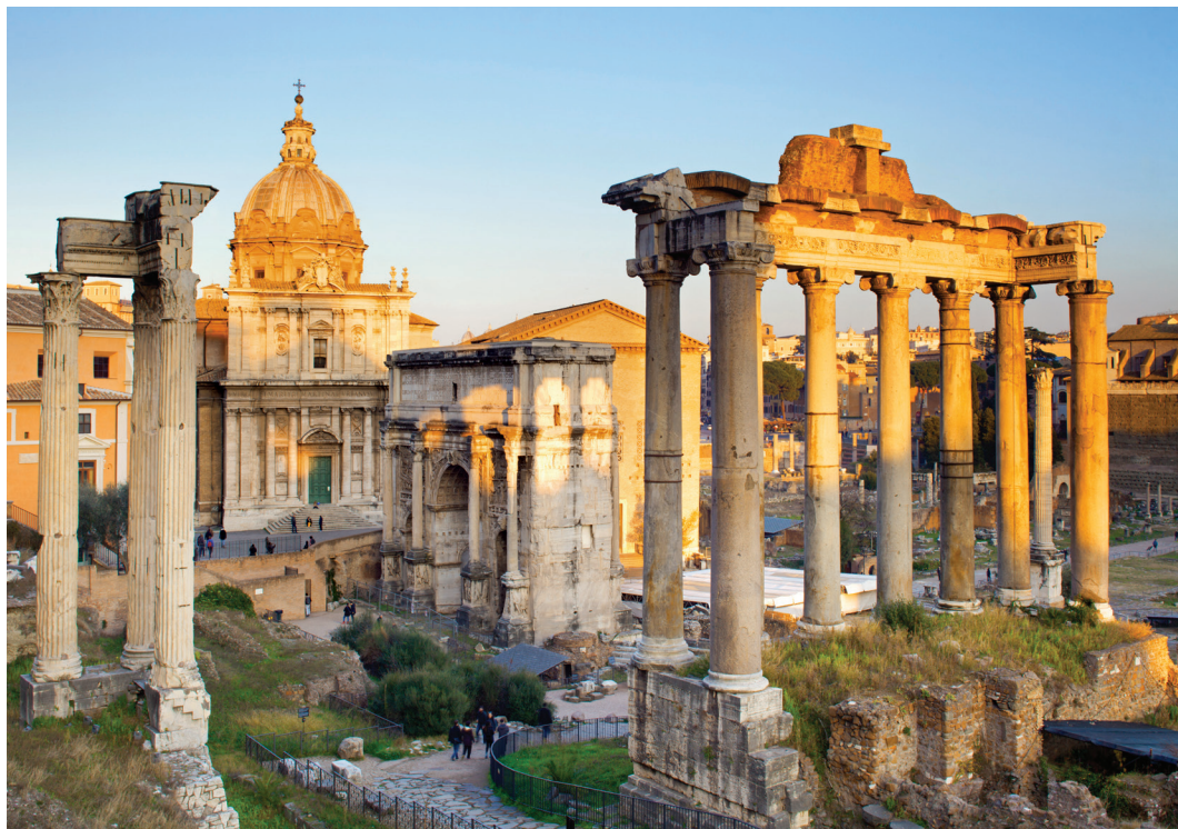
The Roman Forum dates to the 7 th century BCE.

Day 7: Rome Another morning of touring followed by a free afternoon. Today we visit the Vatican for a tour of St. Peter's Square and Basilica, and the Sistine Chapel in the Vatican Museums. Highlights include Michelangelo's Pieta in St. Peter's, considered one of the greatest sculptures of all time; his frescoed ceiling of the Sistine Chapel, now restored to its original glory; and art-filled St. Peter's itself, the most important church in all Christendom. B