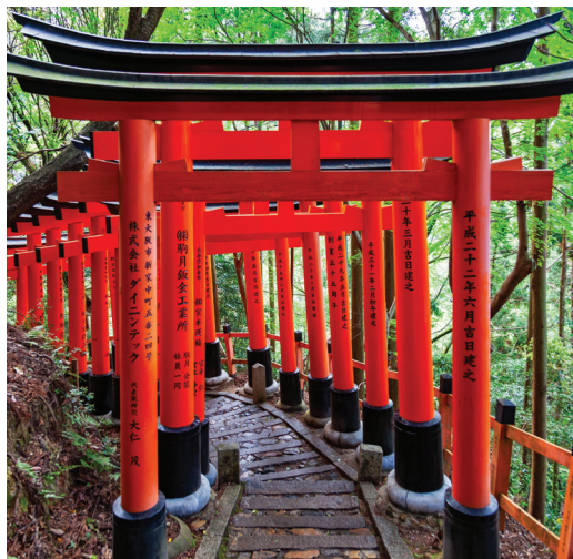
We visit Kyoto’s Fushimi Inari shrine on Day 12.

Day 12: Kyoto We continue our encounter with Kyoto today, first at the important Fushimi Inari shrine, with its trails straddled by some 1,000 red torii gates; Sanjyusangendo Hall (ca. 1266), an important Buddhist temple housing 1,000 statues