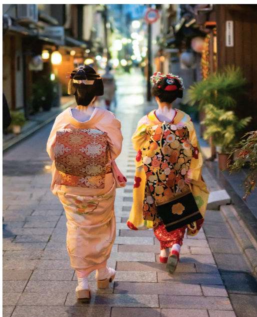
Geishas in traditional dress

of the Thousand-Armed Kannon deity; and Nishiki Market, “Kyoto’s Kitchen” of restaurants, stores, and stalls selling everything food-related. Then this afternoon is at leisure; tonight, we toast our adventure at a farewell dinner at a local restaurant. B,D