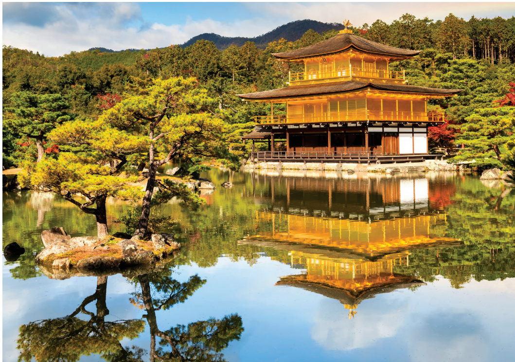
We visit Kyoto's Temple of the Golden Pavilion on Day 10.

Day 6: Hakone/Takayama Today we travel first by bullet train then by Wide View Hida express train to lovely Takayama in the Japanese Alps, considered one of the country's most attractive towns with its beautifully preserved Old Town. Our explorations center on three narrow streets in the San-machi-suji district where, in feudal times, merchants lived amidst the authentically preserved small inns, teahouses, and sake breweries. This afternoon we attend a traditional Japanese tea ceremony here, an historic ritual of form, grace, and spirituality. B,D