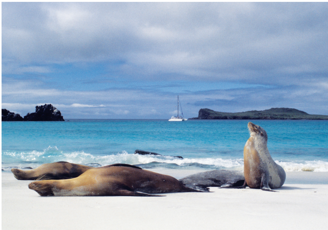
We encounter plenty of wildlife, like these sunbathing sea lions, in the Galapagos.

UNESCO site, which bears the marks of its mixed Inca and Spanish heritage. B,L