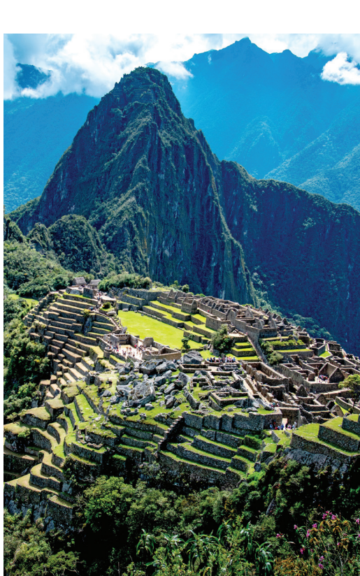
We explore the amazing ruins at Machu Picchu on Days 5 & 6.

Day 15: Quito/Depart for U.S. This morning we visit Quito’s Botanical Gardens, featuring an orchidarium with more than 1,200 species of orchids; and Iaquito Market, a colorful riot of fresh produce and spices. Then we return to the hotel for an afternoon at leisure before tonight’s transfer to the airport for our overnight flight to the U.S. B