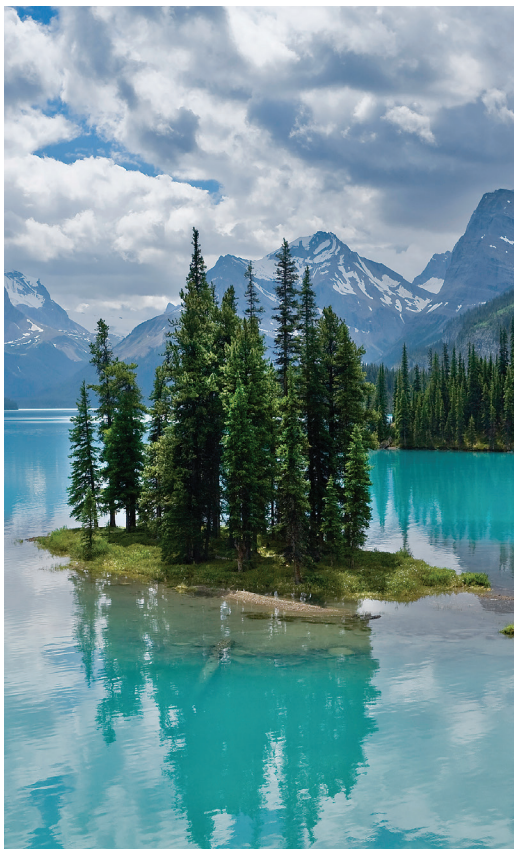
Spirit Island sits in stunning Maligne Lake.

limestone spires strung along a wooded hillside; and Bow Falls, a wide waterfall just outside Banff. The afternoon is free to explore Banff before we celebrate our outdoor adventures with a farewell dinner at our hotel. B,D