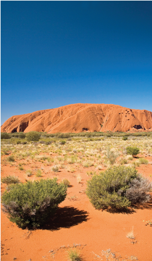
Aboriginal site of Uluru (Ayers Rock)

Prices include int’l airfare and all taxes, surcharges, and fees.