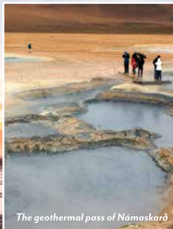
The geothermal pass of Námaskarð