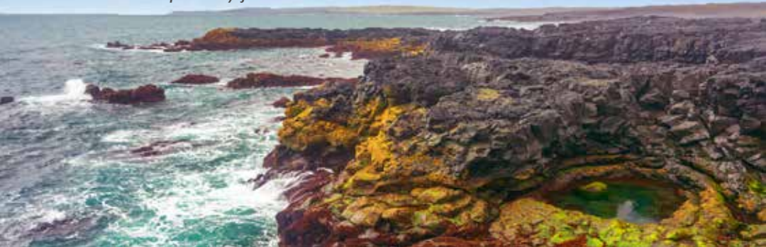
Brimketill natural water pool in Reykjanes Peninsula

Enjoy a scenic drive to Akureyri, the "capital of the north." Stop along the way for lunch at the Hotel Blönduós before checking in to the Icelandic-style Hótel Kea . This afternoon you will enjoy a visit to the Forest Lagoon, located in