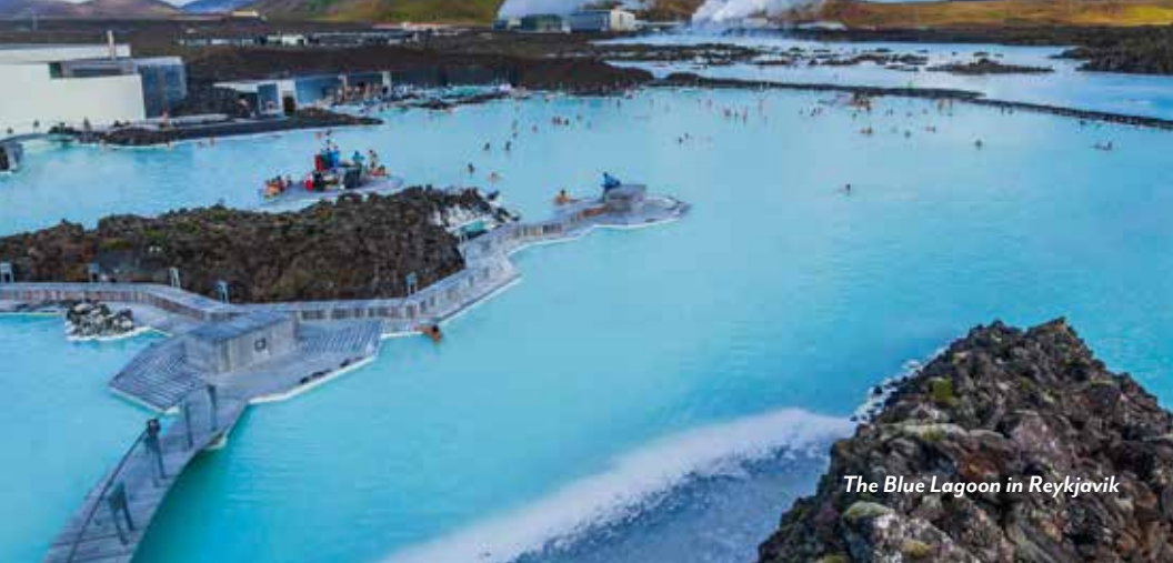
The Blue Lagoon in Reykjavik