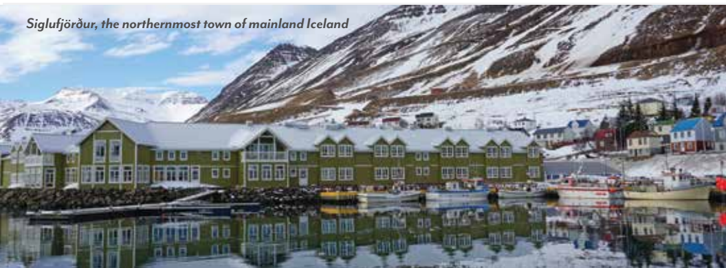
Siglufjörður, the northernmost town of mainland Iceland

Transfer to the airport for your flight back to your home city. (B)