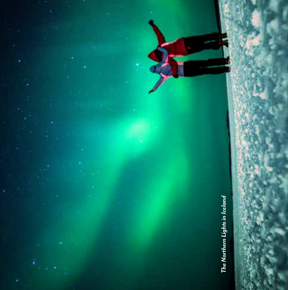
The Northern Lights in Iceland

PRSRRT STD U.S. Postage PAID Gohagan & Company