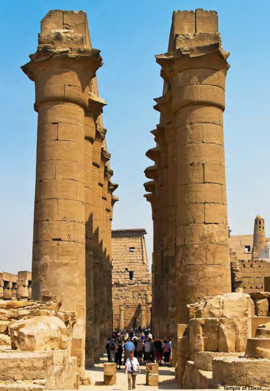
Temple of Luxor