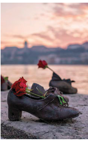
Shoes on the Danube Bank, Budapest