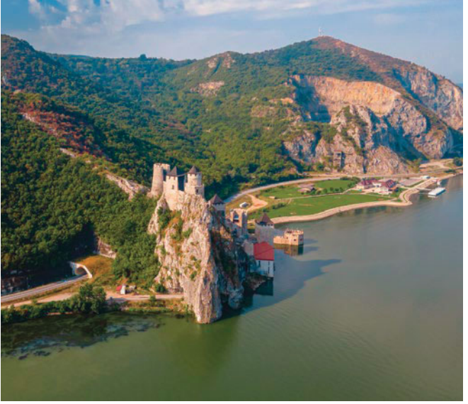
Banks of the Danube River, Serbia