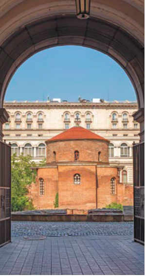
St. George Rotunda, Sofia

Knowledgeable Lecturers deepen your appreciation for the region and its history, culture and current events.