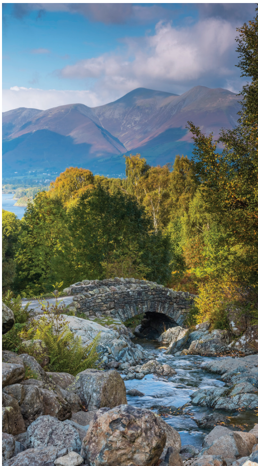
Bucolic Lake District scene

Day 14: Depart for U.S. We transfer this morning to Heathrow Airport for our flights home. B