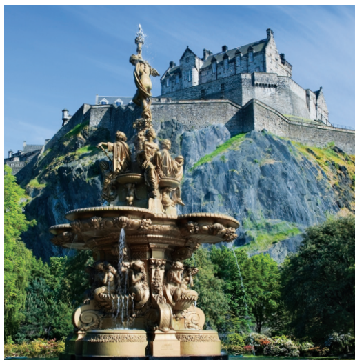
Scotland’s Edinburgh Castle