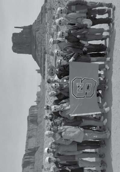
NC State alumni on Orbridge's Southwest National Parks 2023 travel program.

Special Alumni Rate: Save more than $1,000 per couple