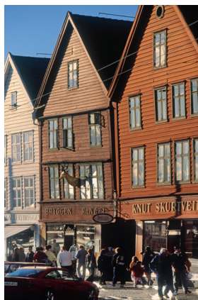
Bergen’s Bryggen district

Day 14: Oslo This morning we visit the Museum of Cultural History, Norway’s largest collection