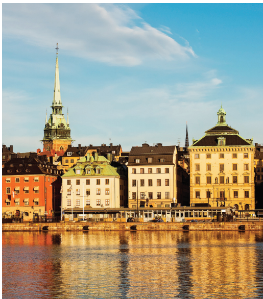
The sun sets over Stockholm, Sweden, as seen on optional extension.

afternoon is free to explore on our own; tonight we gather for a farewell dinner at our hotel. B,D