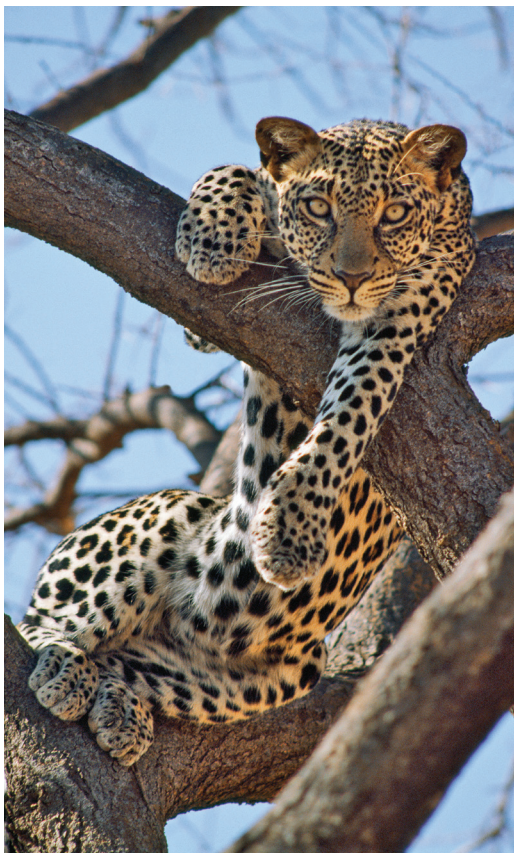
Getting comfortable ...