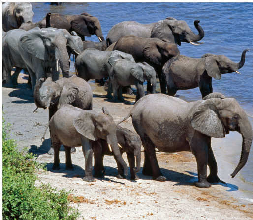
Elephants abound at Chobe.

Day 14: Arrive U.S. We arrive in the U.S. this morning and connect with our flights home.