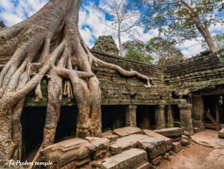
Ta Prohm temple