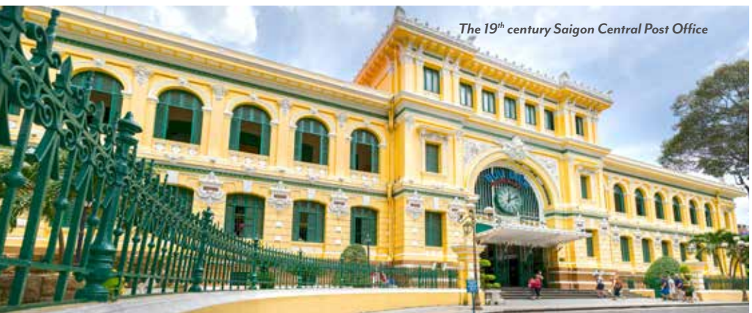
The 19 th century Saigon Central Post Office

See breathtaking views of the coastline as you cruise from Da Nang to