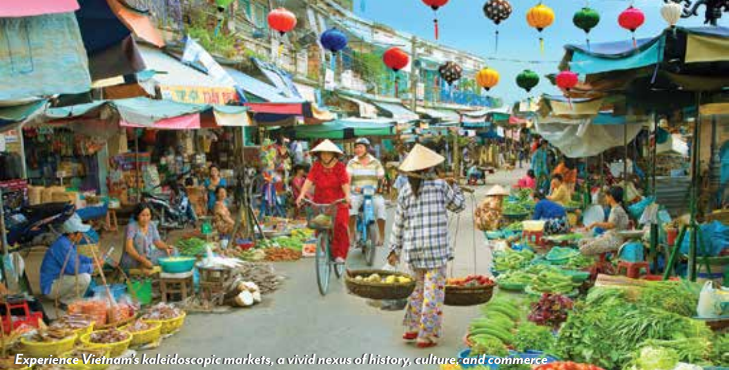
Experience Vietnam's kaleidoscopic markets, a vivid nexus of history, culture, and commerce

Chan May. The countryside awaits in Chan May as you experience a small boat cruise down the Perfume River and a scenic drive to the 19 th -century Tomb of Tu Duc—one of the most impressive of the royal mausoleums, designed by Emperor Tu Duc himself during the Nguyen dynasty. (B,L,D)