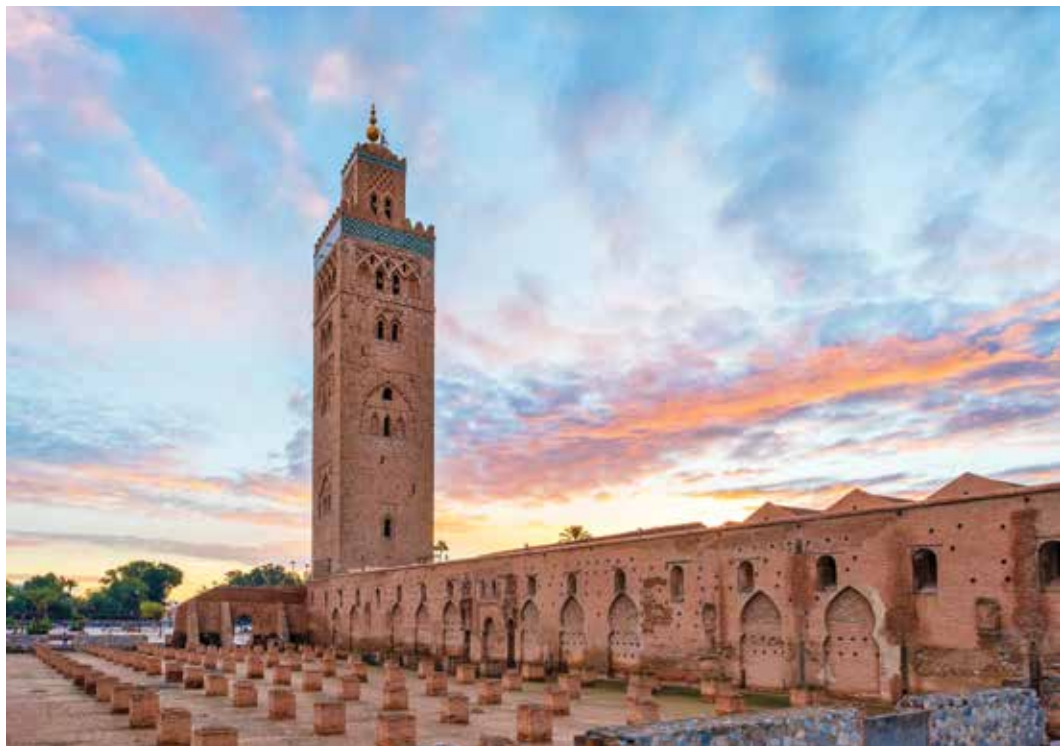
We see the distinctive Koutoubia Mosque – Marrakech’s largest – on Day 11.

Day 6: Fez We begin today with a visit to the Al-Attarine Madrasa, whose highlight is a small courtyard showcasing intricately detailed tilework and carving decorations dating to the early 1300s. We then continue our discovery on a walking tour of the medina focusing on the artisans’ quarters, the 14 th -century Koranic schools, and Al Karaouine, the medieval theological university. The remainder of the afternoon is free for independent exploration and lunch on our own. Tonight, we enjoy a private dinner at an intimate family-run riad in Fez. B,L,D