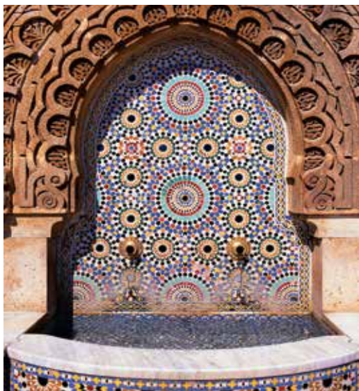
Traditional Moroccan tile work

Day 10: Ouarzazate/Ait ben-Haddou/Marrakech En route to Marrakech today, we stop first at uninhabited Ait ben-Haddou, a UNESCO World Heritage site and one of southern Morocco’s most scenic villages that is often used as a location for fashion and film shoots. Its old section consists of deep red kasbahs packed together so tightly they appear to be a single unit. Then, as we begin our descent from the High Atlas, we pass through typical villages with fortified