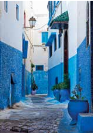
Rabat’s Kasbah des Oudaias

Day 13: Marrakech/Casablanca We leave Marrakech this morning by coach for storied Casablanca, Morocco’s largest and most cosmopolitan city. After a brief orientation tour of the city, we visit the magnificent Hassan II Mosque, Morocco’s only functioning mosque open to non-Muslims. Tonight we celebrate our Moroccan adventure at a farewell dinner at a local restaurant. B,D