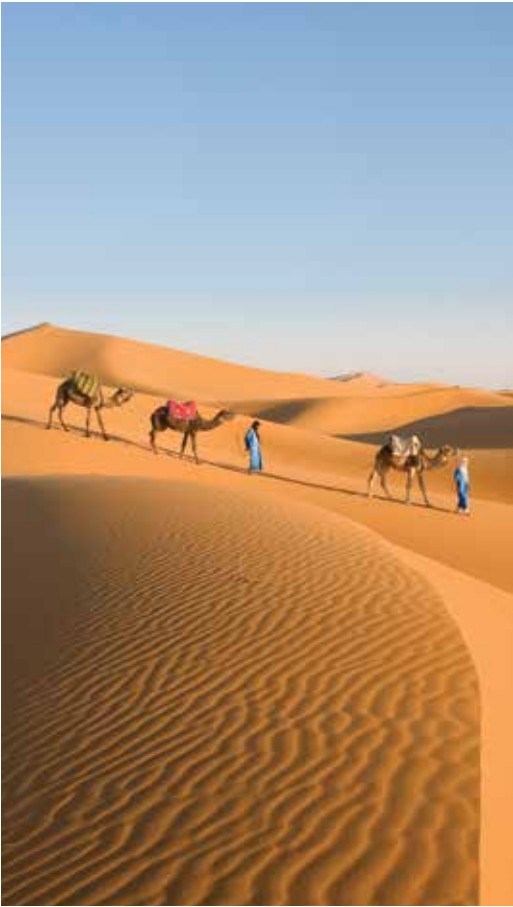
We ride camels in the Sahara.