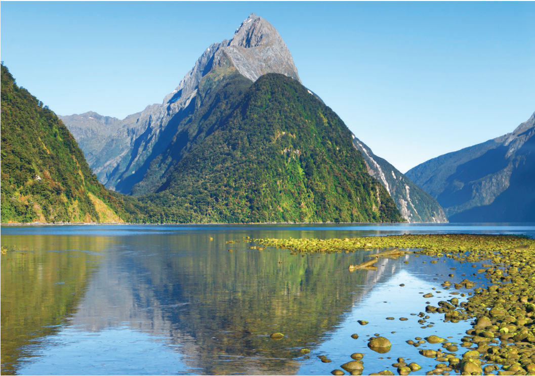
We visit Milford Sound on Day 16.

Day 9: Ayers Rock/Sydney This morning we visit the base of Uluru and the interesting museum here. Mid-day we fly to Sydney, arriving late afternoon. B,D