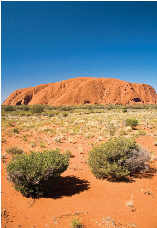
Aboriginal site of Uluru (Ayers Rock)

Day 21: Auckland Our half-day tour of this city set atop 48