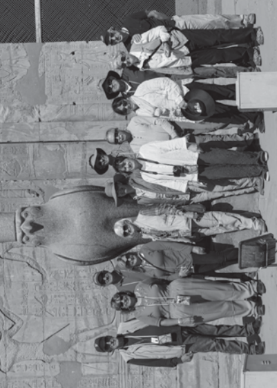
NC State alumni on Orbridge's Discover Egypt & the Nile Valley 2019 travel program.