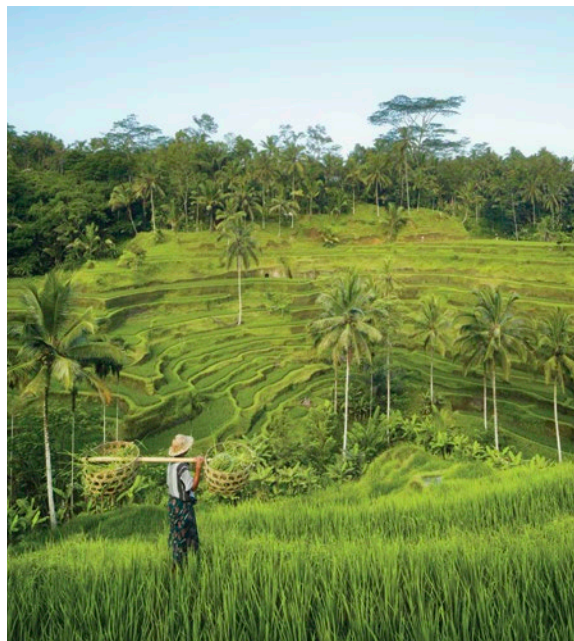
Rice field near Ubud, Bali

Join an enriching 12-night adventure to Southeast Asia, a land of stunning diversity. Begin in beautiful Bali, a treasure trove of cultural landmarks. Fly to Singapore and witness this modern city's fascinating attractions and neighborhoods. Unravel Bangkok's myriad layers found within its winding canals and opulent palaces and shrines. Venture beyond Bangkok to the early Siem capital of Ayutthaya before capping off the journey in Cambodia. Here, encounter the remarkable Angkor Wat and other ancient temples. Along the way, the region's welcoming locals share insights into their lives, cuisine and unique traditions.