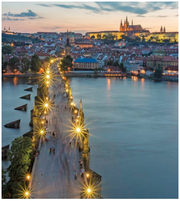
Charles Bridge, Prague

Explore eight countries, Old World capitals and charming villages along the mighty Danube River. Begin in Sofia, Bulgaria, set sail on the storied Danube River, and conclude your adventure in Prague, Czech Republic. Uncover the history of ancient Roman ruins, castles and fortresses, and feast your eyes on an illuminated Budapest, the lush Wachau Valley and the Iron Gate Gorge. Aboard your ship, delight in a Serbian folk show, an authentic German Frühschoppen and enriching lectures. Plus, select from a choice of included excursions in many ports, featuring local cuisine, cycling, art tours and more!