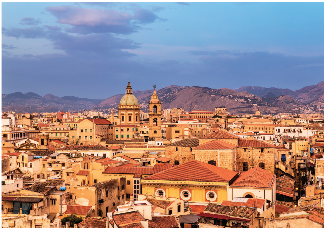
The sun rises over the city of Palermo.

cathedral, another gem of Arab-Norman Palermo and one of the finest examples of Norman architecture still in existence. The imposing main façade and ornate outer cloister serve to prepare us for the cathedral's breathtaking main sanctuary, where every inch of wall and ceiling space is covered with painstakingly detailed mosaics. Crafted by artisans from Constantinople (now Istanbul), the dazzling mosaics contain some 4,850 pounds of pure gold. Next we visit a nearby family-owned winery, where we enjoy a wine tasting and lunch. Our journey then continues; late this afternoon we reach Agrigento and our hotel, where we dine together tonight. B,L,D