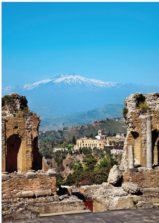
Taormina's ancient theater overlooks Mt. Etna.

Day 11: Taormina This morning we embark on a walking tour of this delightful medieval town set on a rocky terrace overlooking the Ionian Sea. Highlights include the 3 rd -century BCE Greek theatre, where gladiators once battled; the 13 th -century fortress-like Duomo ; and grand Piazza Vittorio Emanuele, site of the ancient agora and today an inviting plaza. This afternoon is at leisure to enjoy Taormina as we wish; tonight we celebrate our Sicily adventure over a farewell dinner at a local restaurant. B,D