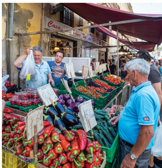
Colorful Sicilian street scene

Day 12: Depart for U.S. We transfer today to the Catania airport for our return flight to the U.S. B