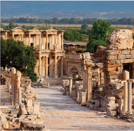
Ruins at Ephesus

Day 14: Antalya/Perge This morning we explore the ruins at Perge, an ancient Greek city once among the world’s prettiest and most prosperous. We also visit the Duden Waterfalls, which tumble about 130 feet into the Mediterranean. Returning to our hotel, this afternoon is at leisure. Tonight, we celebrate our Turkish adventure over a farewell dinner at a harbor-side restaurant. B,D