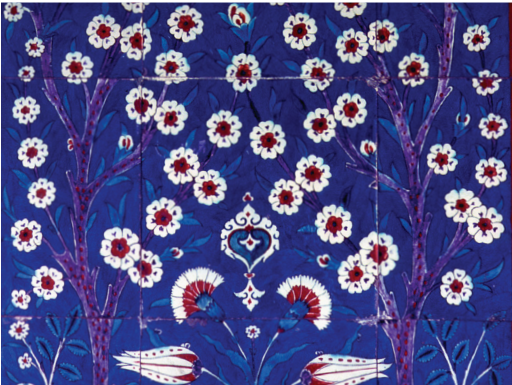
Exquisite Iznik tiles

Day 13: Antalya We discover Antalya’s charming old city (Kaleici) on a morning walking tour through its narrow streets, past historic buildings, mosques, and parks. After lunch at a local restaurant, we visit Antalya’s acclaimed Archaeological Museum, housing priceless artifacts unearthed from sites throughout the region. B,L