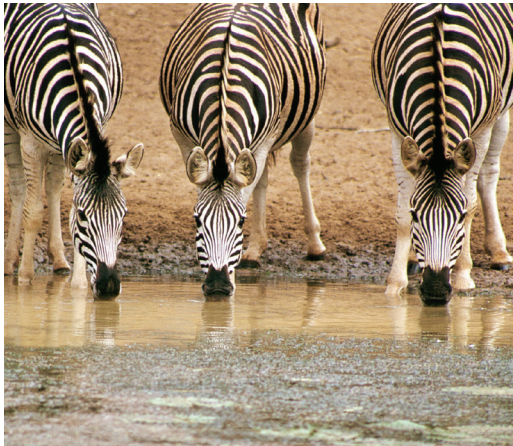
Zebra roam freely in Chobe National Park.