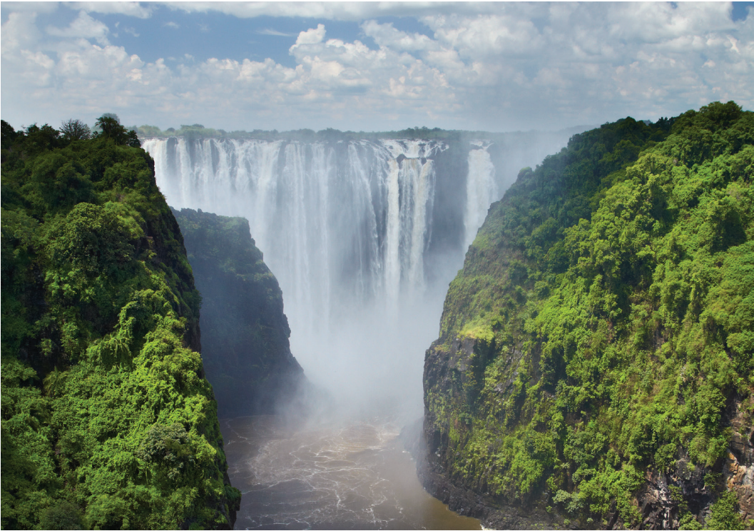
Known as the “Smoke that Thunders,” Victoria Falls is one of the wonders of the natural world.

River, where we may see hippo, crocs, and some of the park’s 450 species of birds (including the sacred ibis, carmine bee-eaters, fish eagles, and kingfishers). We dine tonight at our lodge. B,L,D