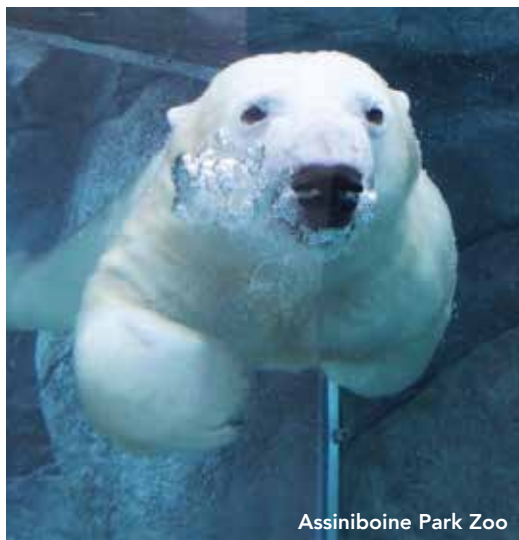
Assiniboine Park Zoo