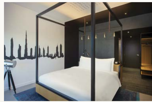
Canopy by Hilton Dubai Al Seef | Dubai