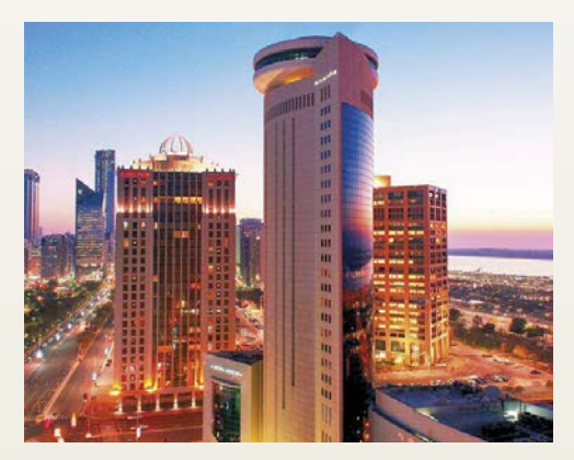
Le Royal Méridien Abu Dhabi | Abu Dhabi OOOOO