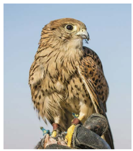
Falcon, UAE's national bird

Check in to the Le Royal Méridien Abu Dhabi.