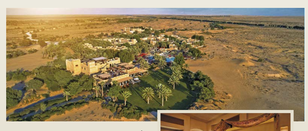
Bab Al Shams Desert Resort & Spa | Arabian Desert