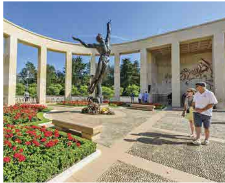
Normandy American Cemetery