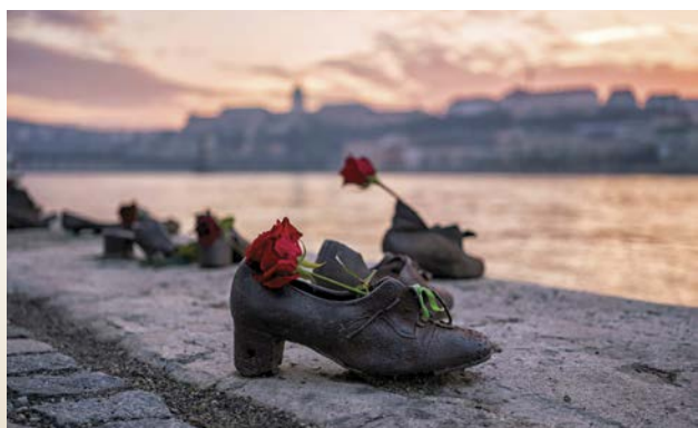
Left: Serbian folk dancers | Above: Shoes on the Danube Bank Memorial