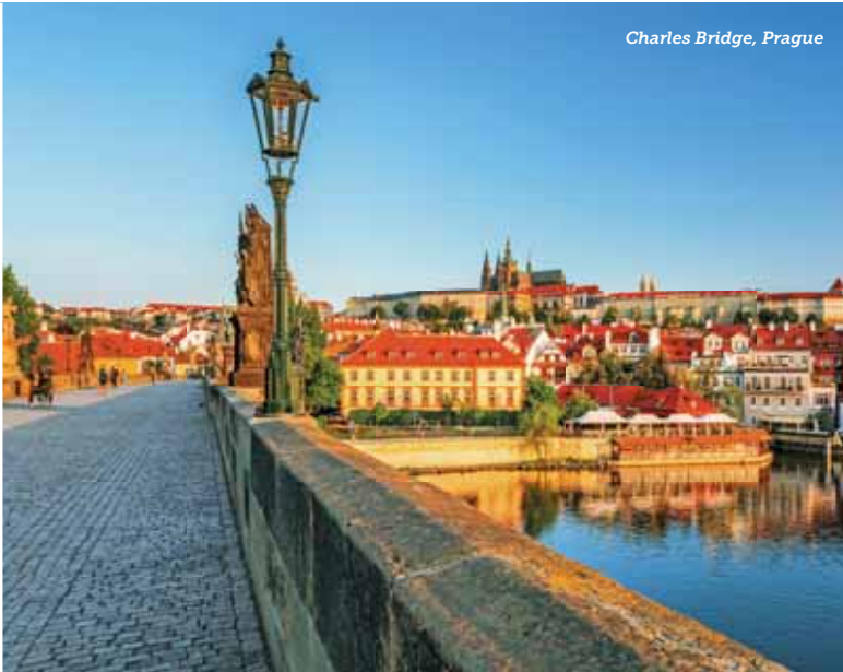
Charles Bridge, Prague