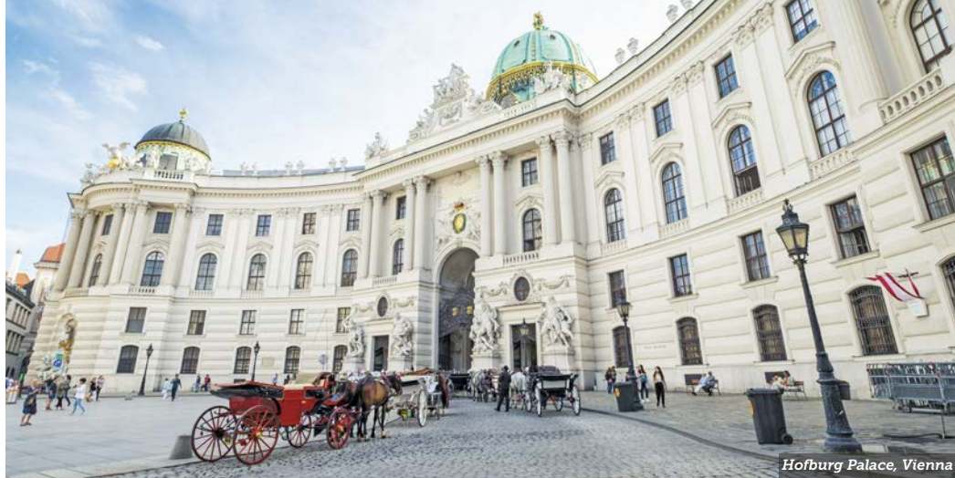
Hofburg Palace, Vienna

• Old Town and Café. Discover Bratislava's rich past. See St. Martin's Cathedral, the Slovak National Theatre, St. Michael's Gate and Primate's Palace, and sample pastry at a café.