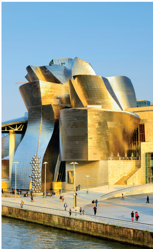
Bilbao’s iconic Guggenheim Museum

Day 17: Depart for U.S. We transfer to the airport this morning for our connecting flights to the U.S. B