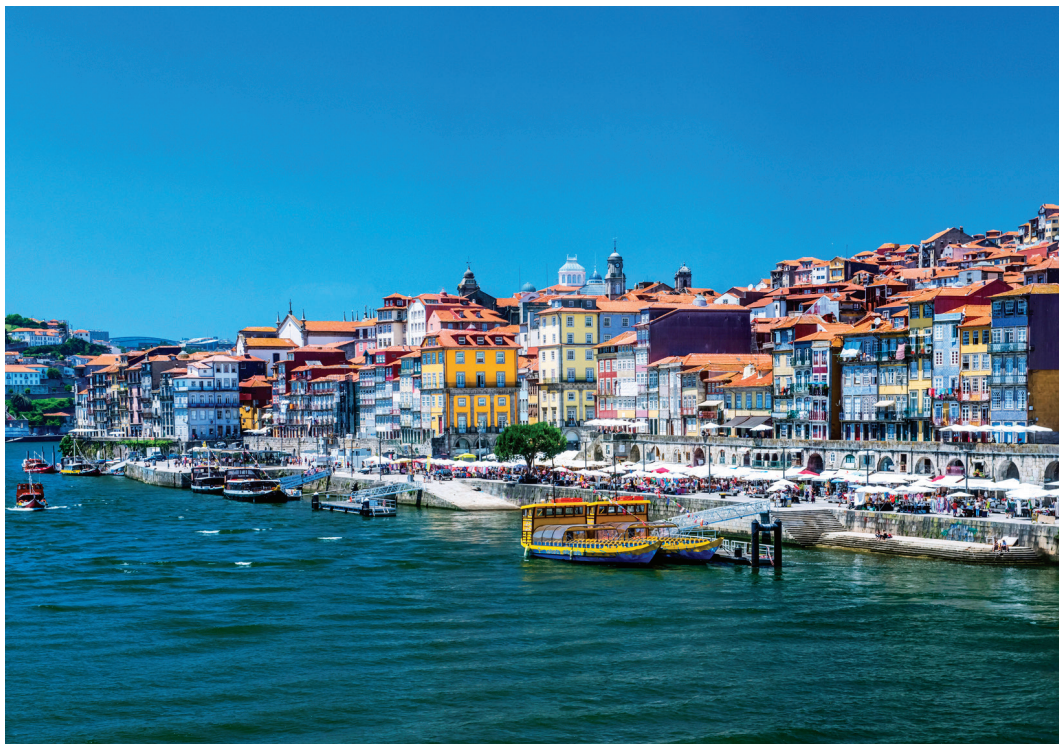
We visit the coastal city of Oporto on Days 4 & 5.

Way of St. James pilgrimage route and known for its religious festivals and Easter Week processions. Upon arrival, we encounter the city's impressive historical and architectural heritage as we visit the 12 th -century León Cathedral, one of Spain's most beautiful with its sculpture-covered façade and impressive stained glass windows; and Casa Botines, a Modernist structure by architect Antoni Gaudí. We reach our hotel early this evening and dine there tonight. B,D