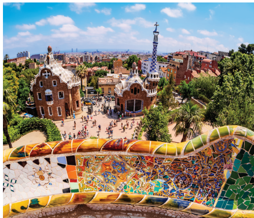
Barcelona’s colorful Parc Guell, which we visit on Day 15