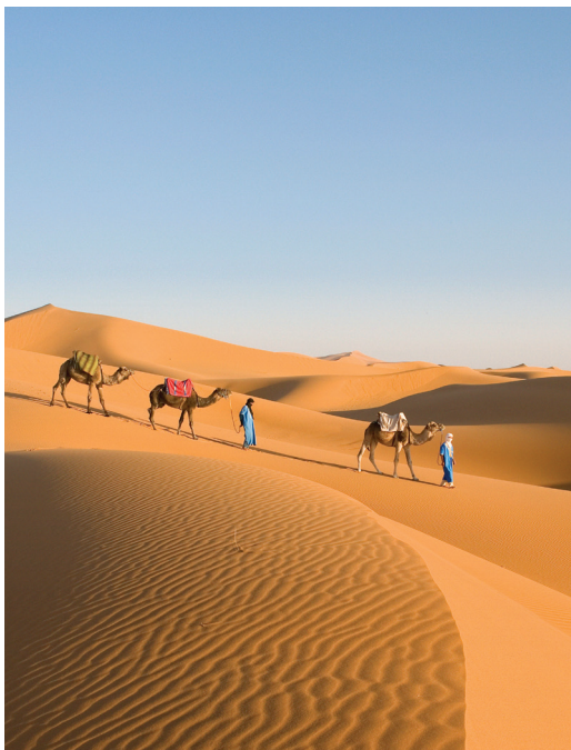
We ride camels in the Sahara.

to non-Muslims. Tonight we celebrate our Moroccan adventure at a farewell dinner at a local restaurant. B,D