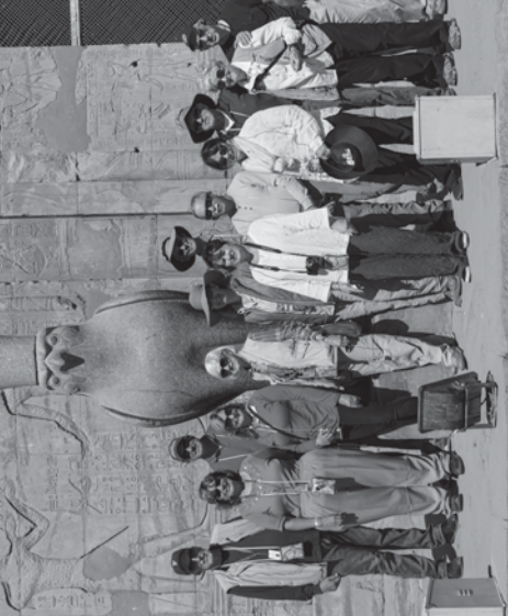
NC State alumni on Orbridge's Discover Egypt and the Nile Valley 2019 travel program.