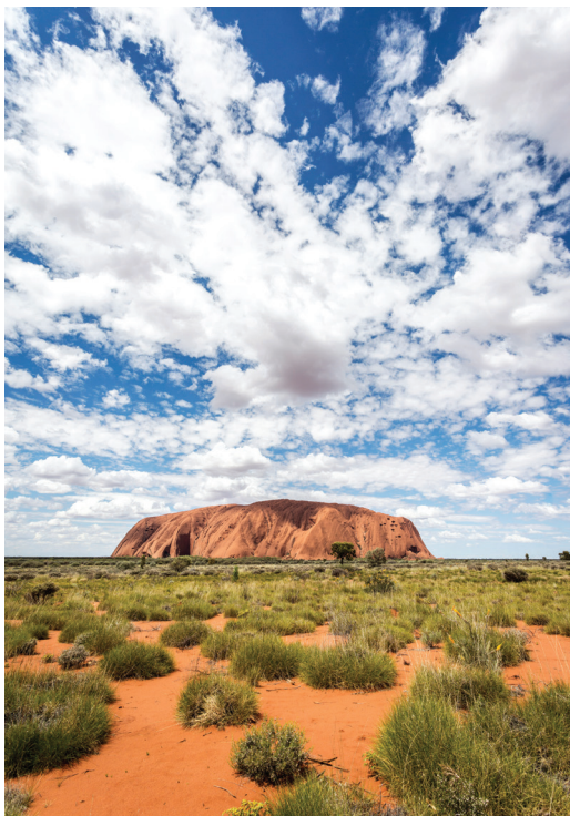
We visit the Aboriginal site of Uluru (Ayers Rock) on Day 6.