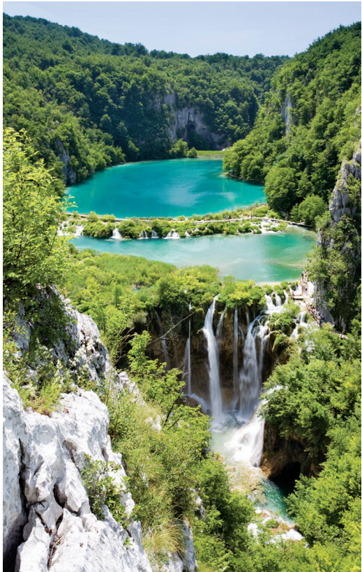
We visit Plitvice Lakes on Day 9.