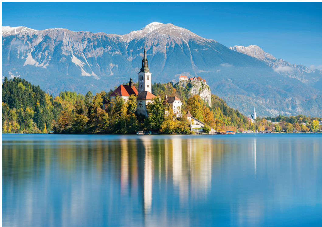
Lovely Lake Bled, surrounded by mountains and forests, which we visit on Day 5

Day 7: Opatija/Istrian Peninsula Today's tour of the Istrian Peninsula reveals the multicultural roots of this alluring spit of land jutting into the Adriatic. At various times a vassal of Venice, the first Austro-Hungarian Empire, Fascist Italy, the Yugoslav Federation, and finally, Croatia, Istra, as it is known, boasts an interesting history, mild Mediterranean climate, lovely scenery, and good wines. Our first stop is in the port of Pula, where we visit the well-preserved remains of a Roman amphitheater (c. 177 CE). Next is Rovinj, a charming old Venetian port where we are free to explore on our own and perhaps enjoy lunch at an outdoor café. After returning to Opatija late this afternoon, we dine together tonight at a local restaurant. B,D