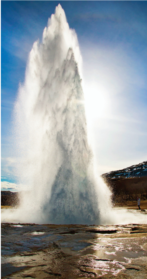
Iceland's hot spring geysers are famous natural attractions.

Day 11: Depart for U.S. Today we depart for the airport and our return flights to the U.S. B