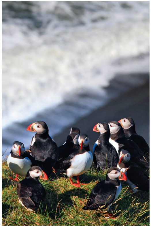
We may see puffins on our tour.