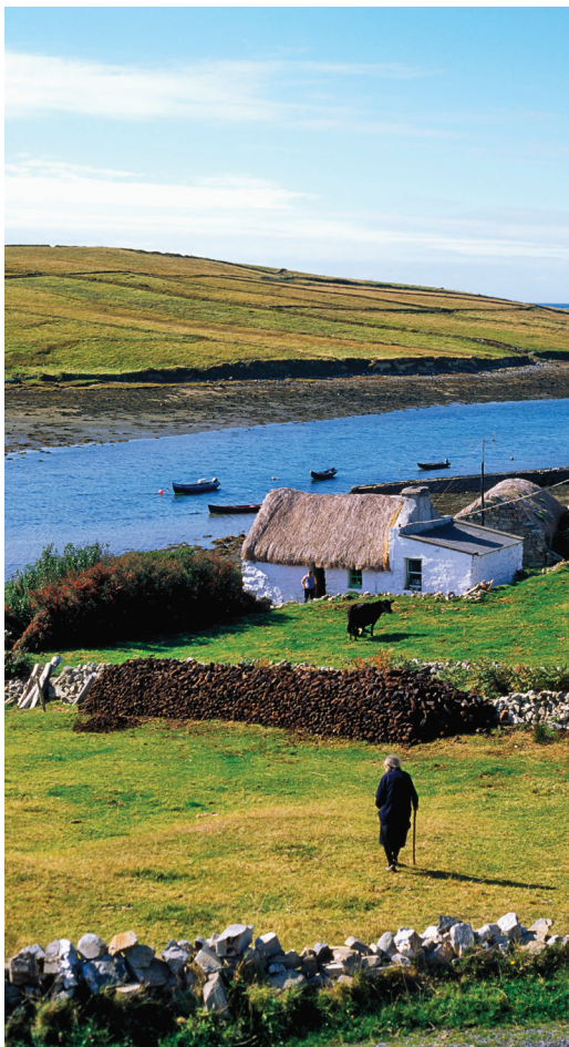
Stone walls wind through the Aran Islands.