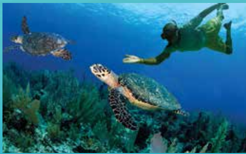
Snorkel among hawksbill sea turtles in the clear-blue waters of St. Vincent and the Grenadines.

Admire the verdant Pitons du Carbet from the Sacré Coeur de Balata, a reduced replica of the Basilica of Montmartre in Paris.