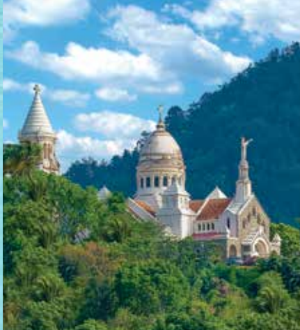
Experience Martinique's French panache with a visit to La Balata.