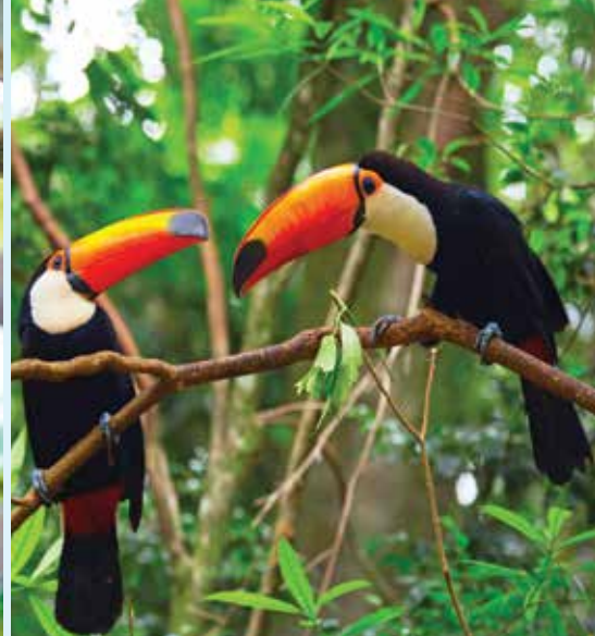
Listen for the white-throated toucan's exuberant call, one of the most characteristic sounds of the rainforest.

Disembark and fly from Iquitos to the ancient Inca capital of Cuzco via Lima. On arrival, transfer to the Sacred Valley of Urubamba,