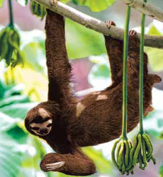
Observe curious creatures like the three-toed sloth in their exotic, untamed natural habitat.

including toucans and saddleback tamarin monkeys, and marvel at giant Victoria amazonica water lilies.