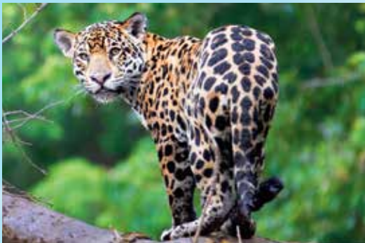
Watch for the sleek, spotted coat of the elusive jaguar as it slinks through the tropical rainforest.

Cover photo: Wind through the mysterious Amazon River aboard the ZAFIRO, the ideal way to explore the largest rainforest ecosystem on Earth.