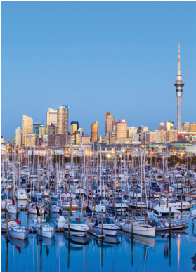
Auckland, City of Sails

Day 19: Rotorua This morning we visit Rainbow Springs Nature Park, a showcase of native flora, fauna, and birdlife, and where we tour the National Kiwi Trust, which rehabilitates injured kiwis, the national bird. B