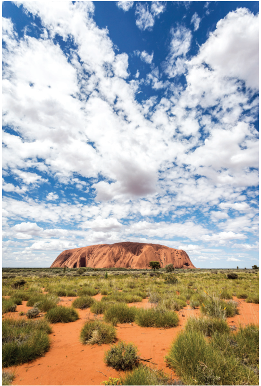
We visit the Aboriginal site of Uluru (Ayers Rock) on Day 8.