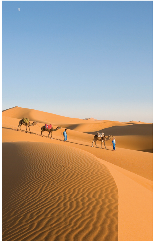
We ride camels in the Sahara.