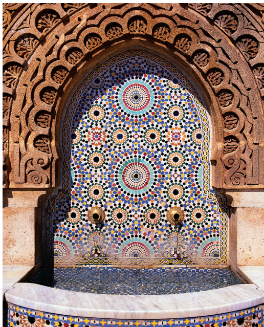
Traditional Moroccan tile work

En route to Marrakech today, we stop first at uninhabited Ait ben-Haddou, a UNESCO World Heritage site and one of southern Morocco's most scenic villages that is often used as a location for fashion and film shoots. Its old section consists of deep red kashabs packed together so tightly they appear to be a single