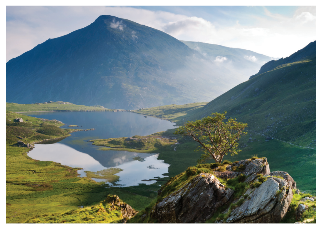
Wales' pristine Snowdonia National Park, which we visit on Day 8

Day 7: Lake District/North Wales We travel through splendid Lake District scenery today en route to Wales, with its rugged natural beauty and distinct culture. Our first stop is at Bodnant Garden, the historic 80-acre National Trust property with a lovely hillside setting and ever-changing displays, from manicured lawns to flower-filled terraces. After our visit, we continue on to the seaside town of Llandudno, dubbed "Queen of the Welsh Resorts," and our home for the next two nights. We dine tonight at our hotel. B , D