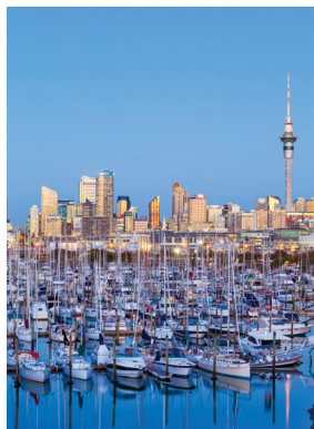
Auckland, City of Sails

Kiwi Trust, which rehabilitates injured kiwis, the national bird. B